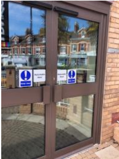
Automatic entrance doors