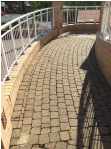
Ramped access to main entrance