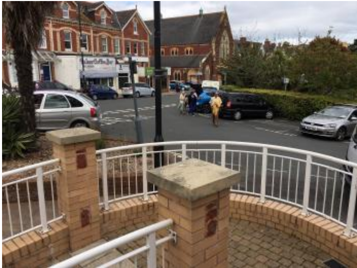
Disabled parking (pay and display)