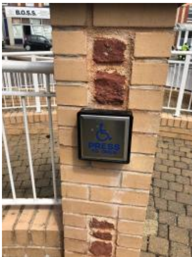
Push pad door entry