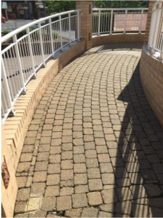
Access ramp at the theatre entrance